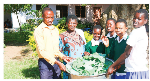
Step by step activities of making a vegetable garden around the school environment

OSNET designed a vegetable garden project using scrap bags that were polluting the school environment and the community at large. The gardens have been set up in areas around the school where many schools use the sites to arrange stones that are less productive than beauty. OSNET has come up with an innovative alternative to using these sites for growing vegetables in scrap bags. Students with disabilities are given more priority to benefit from such innovations. Benefits of this project: • Independent education for gardening of scrap bags in school and home environment • Earn a living by selling vegetables at schools and at home • Environmental and beauty care education • Health and nutrition education