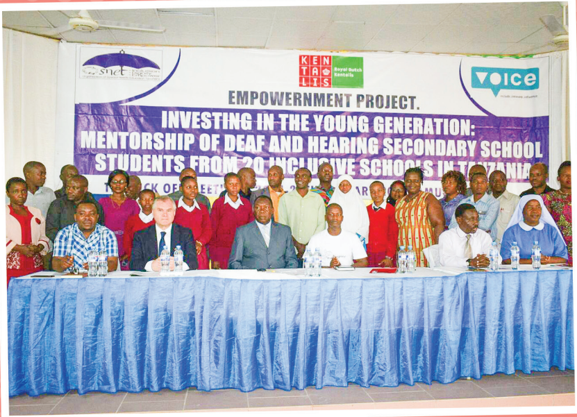
A joint photo of some of the participants of the sign language project meeting at the Archbishop Mihayo University College of Tabora

OSNET in partnership with the Kentalis International Foundation and Voice Grant are running a sign-language project in 20 secondary schools that include both deaf and non-deaf students.