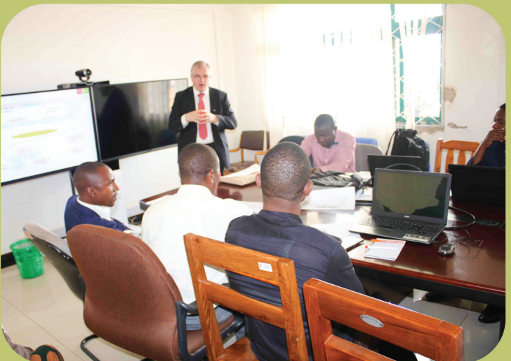
A joint photo project of the sign language project, a representative of Kentalis, a representative of the Tanzania Institute of Education (TIE), a representative from AMUCTA and representatives from the Ministry of Education, Science and Technology after attending a joint session at the ministry in Dodoma.