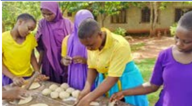
Food production and baking enterprise