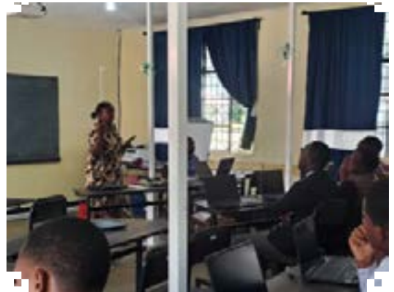
Multiplying Learning Opportunity