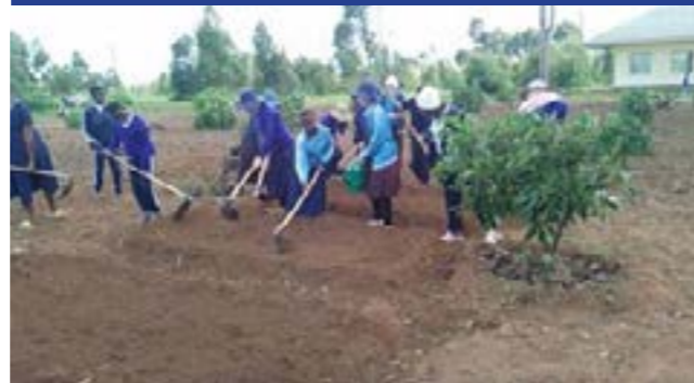
Agricultural crop cultivation project.