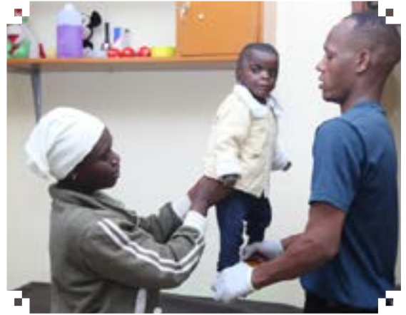
Parenting Care Program