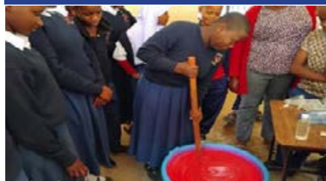
Local soap manufacturing workshop.