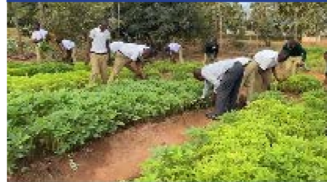
Sustainable crop farming initiative