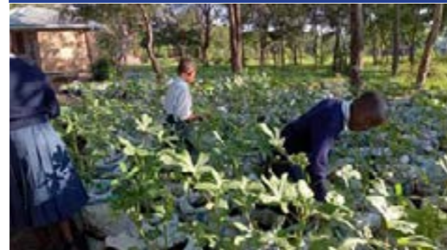
Horticulture and vegetable cultivation project