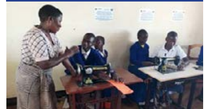
Tailoring, sewing, and textiles workshop