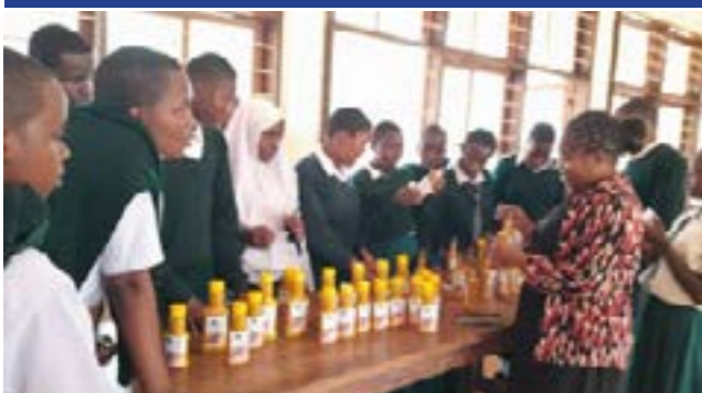
Handmade liquid and bar soap production