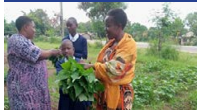
Agricultural and crop management project