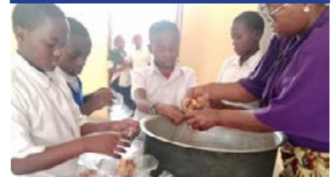
Food preparation project.