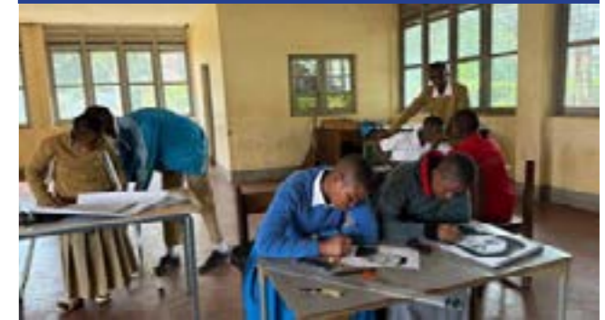
Technical drawing and creative arts workshop