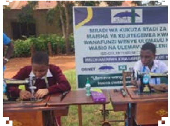
School Entrepreneurship Challenge